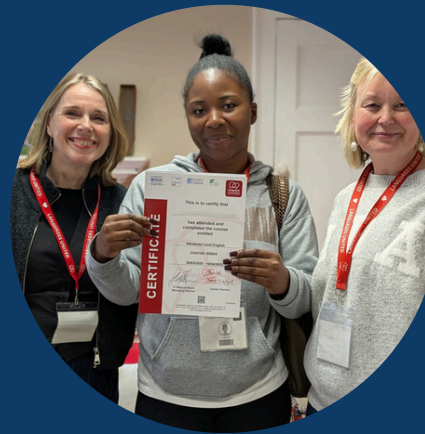
Accent and public speaking coaching

Preparation course for OET or IELTS exams, allowing you to work in the NHS