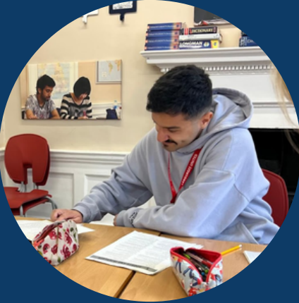
IELTS test preparation