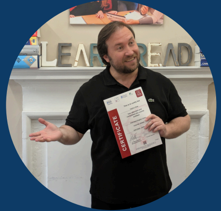
SELT preparation for UK visa applications