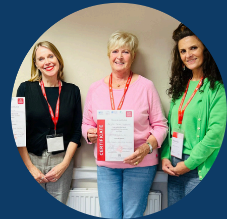
Small group tuition

Work on your accent and pronunciation through learning sounds, stress patterns and intonation.