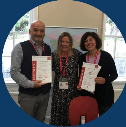
English teacher training