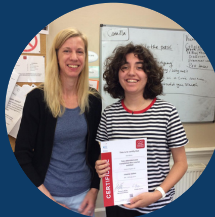
English for young learners

...or general English lessons for development across all skills.