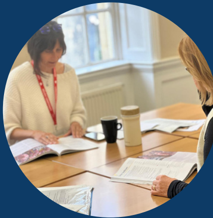
English for healthcare professionals

Preparation course for OET or IELTS exams, allowing you to work in the NHS